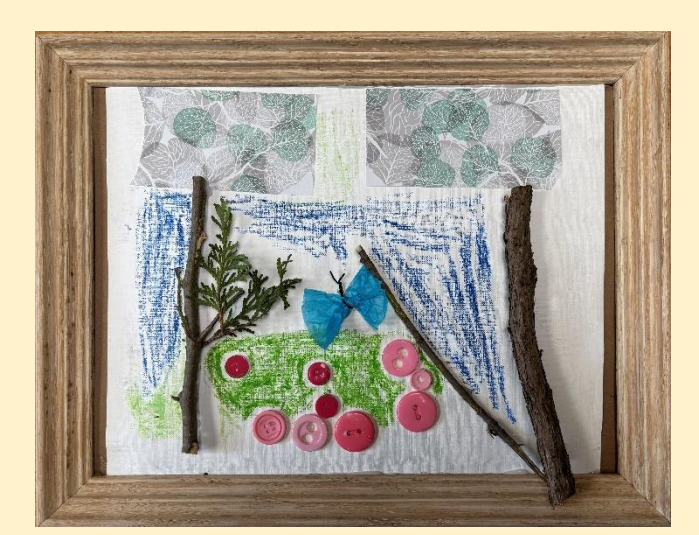
Blessings, Irina + Incumbent

Additionally, we will have a couple of special displays in the parish hall during coffee hours in June. The contemplative art group will present pieces we created over the spring (images of our first few creations are attached), and the Outreach Committee will mount a creative display introducing a summer reading initiative designed to deepen our understanding of Indigenous culture and approaches to reconciliation.