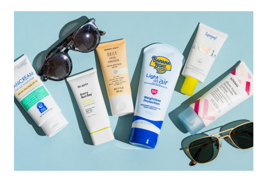
The hot weather is here, fast and furious!

If you have extras or can contribute...we will add to our stock over the summer.