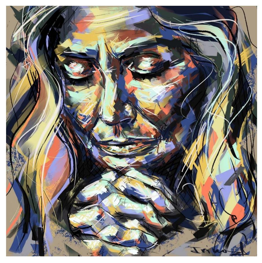
'Hannah's Prayers, Answered' (based on 1 Samuel 1:4-20)

November 17th, 2024 In-Person & Online Service at 10:00am